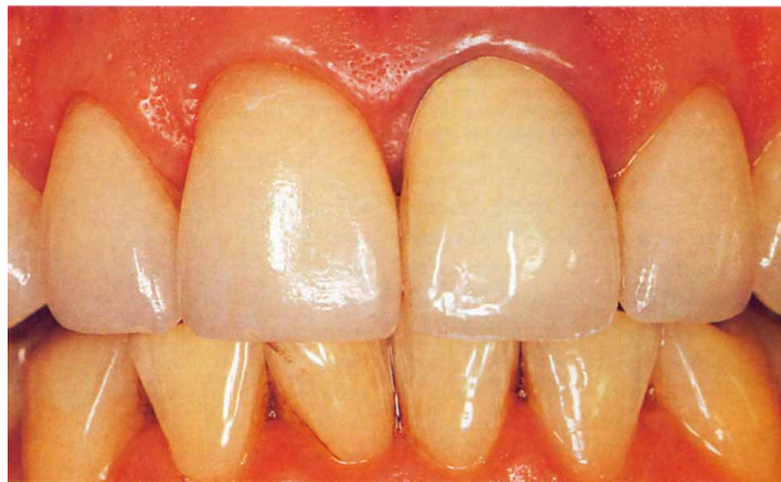
Figure 1. 35-year-old male with five porcelain veneers on the maxillary anterior teeth. A porcelain and gold crown on the maxillary right central incisor has an intrasulcular margin while the porcelain veneers have supragingival margin placement. The iatrogenic periodontal reaction associated with the porcelain and gold crown is self-evident.

When conventional anterior crowns are designed, esthetics dictate that, in most instances, the crown margins terminate at an intrasulcular location. Although this may enhance frictional retention, most often the motivation is esthetic. 1 Many metal ceramic and all-ceramic crowns are replaced for no other reason than to reposition the margins to an intrasulcular location. Over time, tissue migration can again reveal these margins, no matter how carefully the crowns were originally designed. 2,3 Some tissue migration around crown margins in a thin periodontium is considered to be a normal aging process, while other instances can be clearly associated