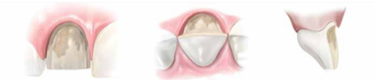
Fig. 6 Fuente: Brian LeSage 15 .