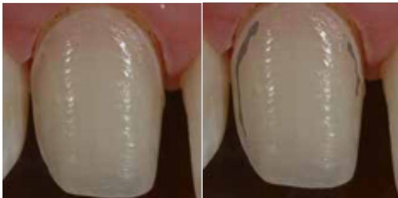
Fig. 2-3 Fuente: Brian LeSage 15 .