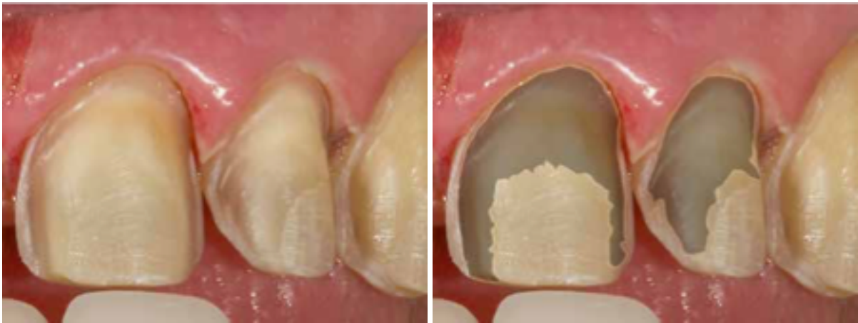
Fig. 7-8 Fuente: Brian LeSage 15 .

Hacer o no preparación es un factor importante para el pronóstico 12 .