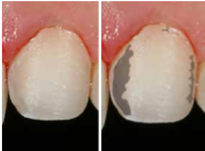
Fig. 4-5 Fuente: Brian LeSage 15 .