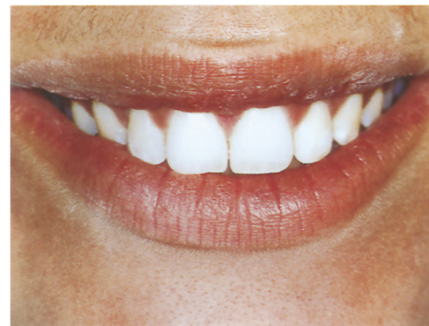
Fig. 2. Diastemata were closed with composites, following natural outline of teeth.

ing with composites is the most conservative approach for several reasons; namely, (1) sound tooth structure will not be removed, (2) anesthetics are infrequent, (3) one appointment is common, and (4) the professional fee is usually inexpensive.