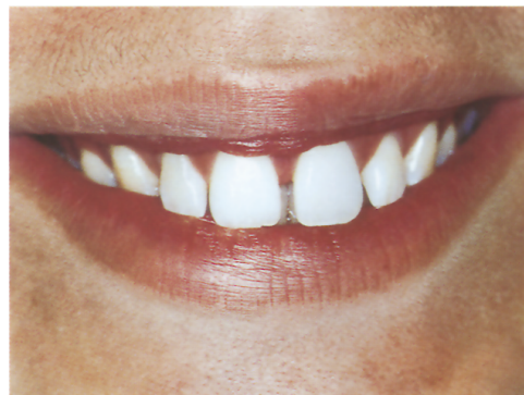
Fig. 1. Patient with diastemata between central and lateral incisors.

When a patient wishes to improve their smile because of dark spaces between the teeth (Fig. 1), esthetic bonding may be the resolution. If the configuration of the teeth is modified, the patient can achieve satisfaction. If the patient does not smoke or drink dark-colored liquids that can alter the color of the teeth, esthetic bond-