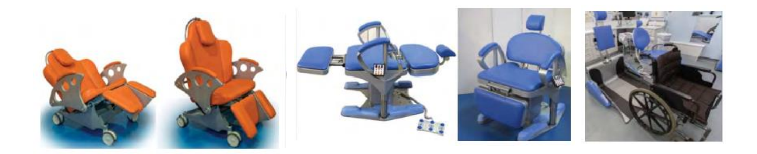
Figure 4: Multifactorial bariatric dental chair, Bariatric treatment chair, Dental wheelchair recliner Image taken from reference (28)

On another hand, dental appointments should be longer for obese people compared to normal weight individuals. As explained before, obese patients need extra time to move around the dental clinic, stand up and sit down may be difficult. Then, during dental treatment the excess of fat in the head and neck area may impair the correct progress of the treatment, and therefore, increase the operating time. Again, during anamnesis, it may require extra time as patients generally come with comorbidities, previous treatments, and medications.