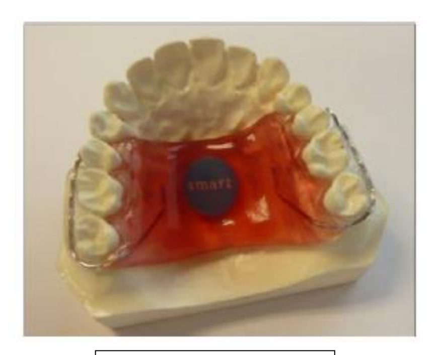
Figure 3 : SmartByte<sup>TM</sup> Image taken from reference (26)

An individual approach with a case-by-case patient's selection should be chosen by the dental practician according to the degree of obesity, the relative risks, as well as the presence of periodontal disease, temporomandibular disorders... Again, it should never be a personal choice of the dentist but should be a multidisciplinary decision. It is not the dentist duty to diagnose obesity, but participation in its treatment is possible, in agreement with other health professionals. The dentist role is to provide the appliance and periodically check the oral state of the patient. Dentits should be aware of all the comorbidities that may be a brake for this type of oral devices. (21)