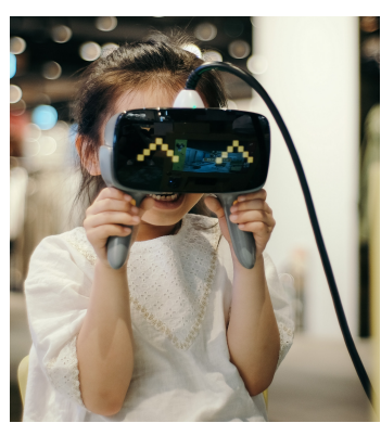
Figure 2. handheld VR headpiece (16)