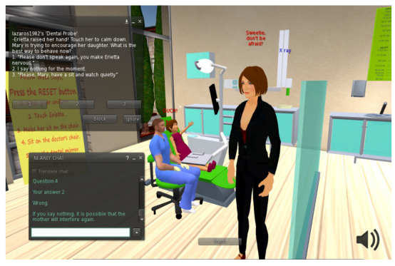
Figure 6. virtual world simulation of dental clinic (19)